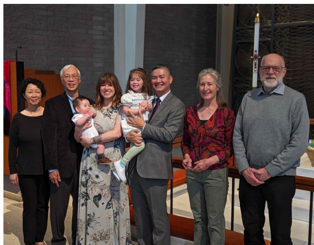
With parents and grandparents