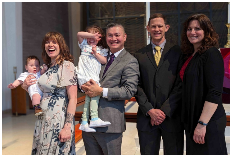
And with the Godparents