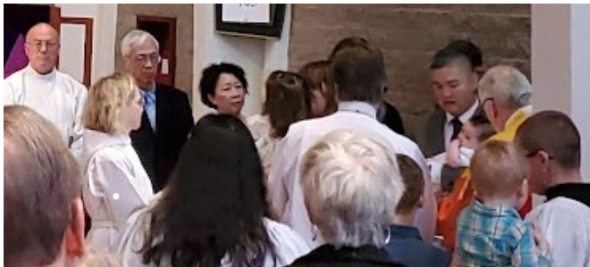
At the Baptismal Font